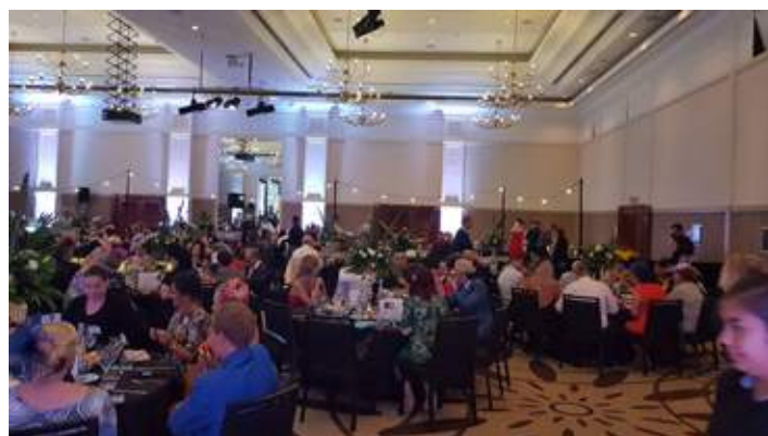
The ballroom at the Pullman Cairns International for the Give Me 5 For Kids fundraiser.