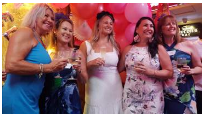
Pretty fillies fundraise for the Foundation at The Cotton Club.